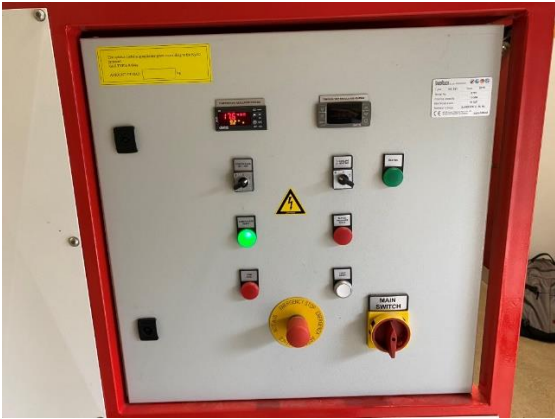
Outdated water chiller technology