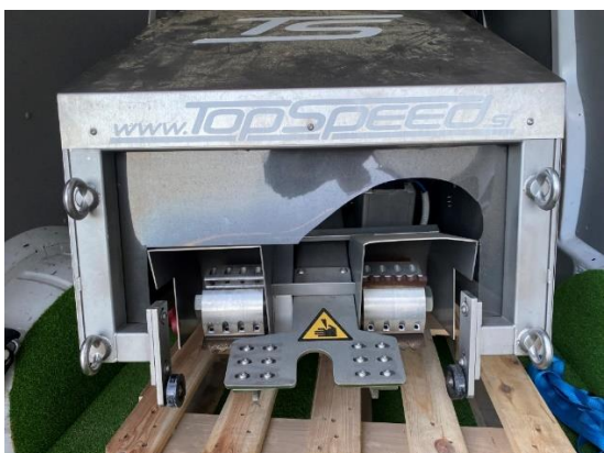
Ice cutter with milling head without safety system with penetrating power