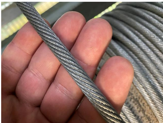
Steel rope – severely damaged