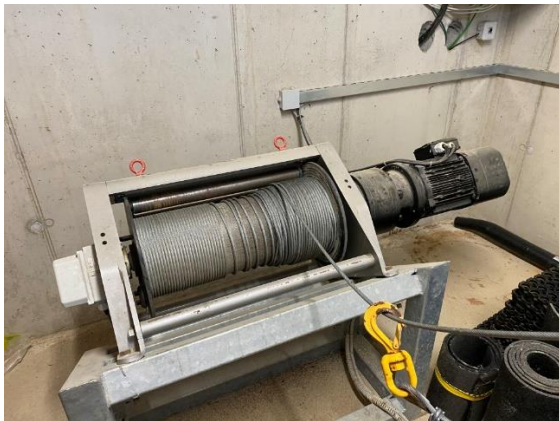
Winch technology – not permitted rope technique